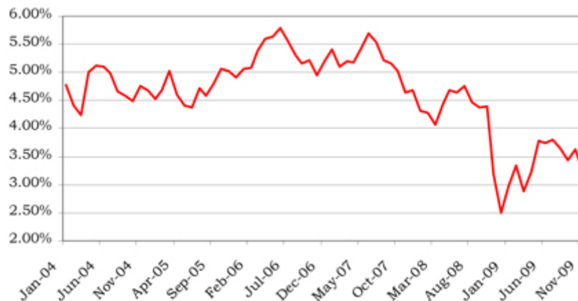
Historical Performance of CMS10

The following graph sets forth the historical month-end levels of CMS10 presented in the preceding table. On December 8, 2009, the pricing date, the level of CMS10 was 3.516%.