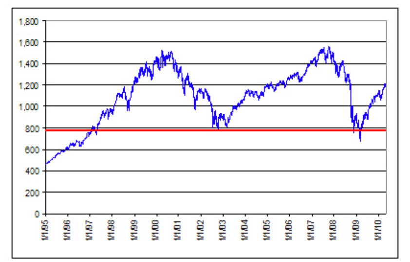
* The bold line in the graph indicates the index reference level of 775.